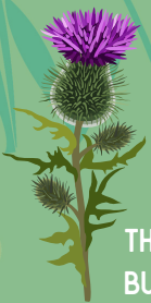
THISTLES: BULL, MUSK, PLUMELESS